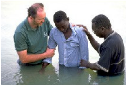
Obedience to Christ in baptism

Our Goal: Africans sharing the Gospel with other Africans