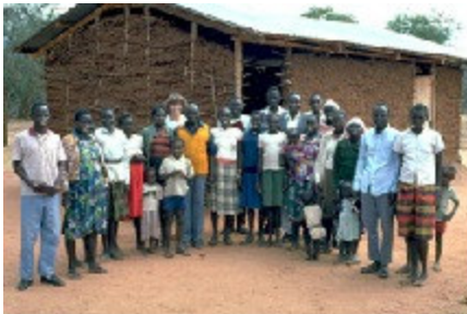
The Church: God's way of reaching the world with the Gospel

How will we do it? God is the one who builds the church. We can only do our best to obey him. We will begin by learning the language and culture of our target people group. As we live among them and learn their ways, we will begin to learn about how God is already working in their culture and the doors he is opening to reach them. Following the leading of the Holy Spirit, we will begin to share the Gospel in various culturally meaningful ways, including personal evangelism, chronological Bible storytelling, and however else God may lead. We will use creative ways to engage the people in their daily lives and reach the people right where they are. We pray that many people will come to faith in Christ through our witness. Then, we will begin to disciple and train the new believers to share the Gospel with others and reach their own people for Christ. We will pray for God to raise up African leaders from within the people group to lead their own churches and plant new ones. We desire to see a movement of doctrinally-sound, God-glorifying, Bible-based, African-led churches, that will plant new churches in an ongoing process of church multiplication. As time goes by, we will probably spend most of our time sharing the Gospel and developing African church leaders.