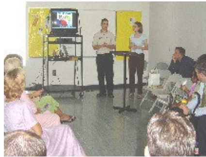
Sunday School in Georgia

Once more, our partnership development took us on the road. This time we visited Virginia, North Carolina, South Carolina, Georgia, and southern Ohio.